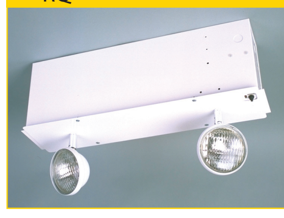
Shown in Standard White Finish

Providing a clean look in commercial facilities, the RQ Series combines the advantage of a fully recessed unit with maximum remote head capability. Also included is Quik-Chek™, our exclusive remote testing feature for emergency lights.